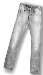
A pair of trousers

anybody. The younger sister also went upstairs and took five centimeters off the legs of the new trousers. You can imagine the boy's face when he put the trousers on the next morning.