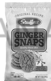
A pack of biscuits

he had one too. She had never met anybody like him. She took her bags and went towards the boarding gate. After boarding the plane, she looked into her bag. She was surprised to find her pack of biscuits inside.